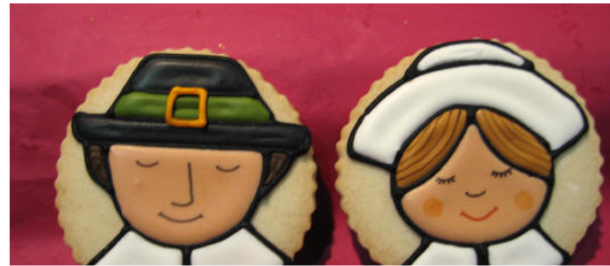
Cookie E & F